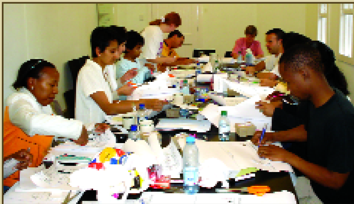
ALP staff members at the projects annual review in September 2005.